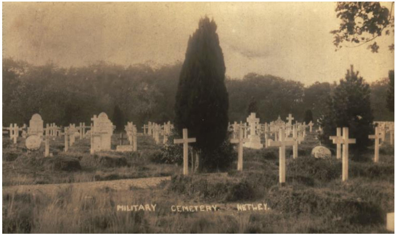
Original Cross markers – Netley Military Cemetery