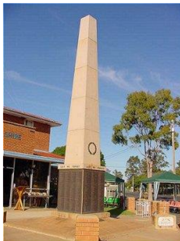
Nyngan & District War Memorial