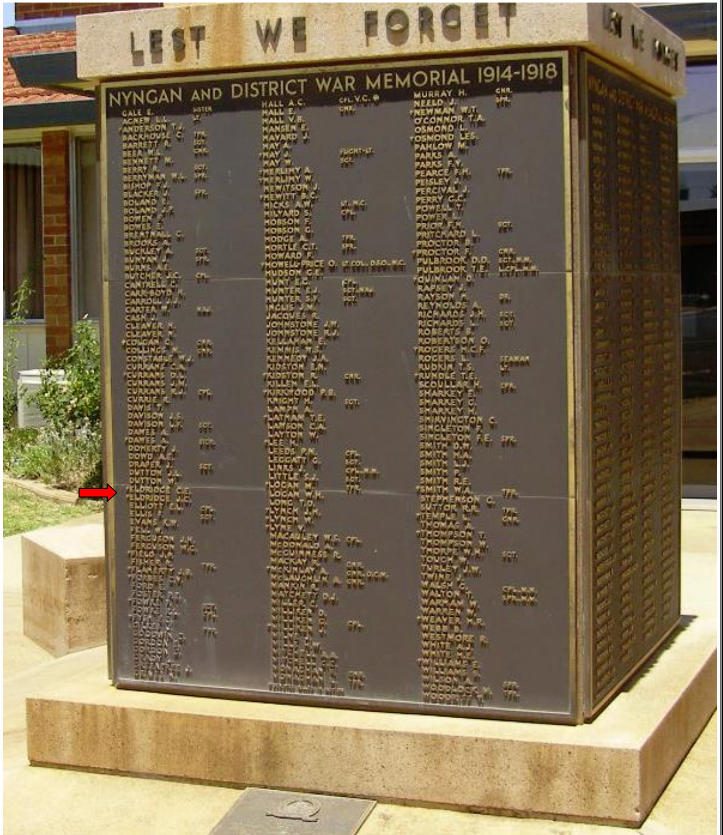
Nyngan & District War Memorial